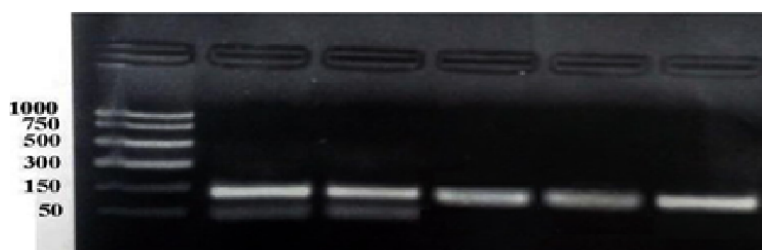
Fig. 2. Gel electrophoresis for the PCR product of the target genomic region after digestion with the fast digest TaI restriction endonuclease