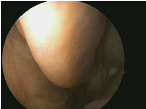
Fig. 1: Endoscopic view of the left nasal cavity showing purulent secretions draining from the left maxillary sinus