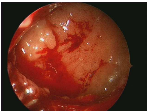
Fig. 3: Endoscopic view of the left maxillary antrostomy using an angled 45-degree endoscope after suctioning and irrigation of the sinus. Note the chronically inflamed, granular appearance of the maxillary sinus mucosa