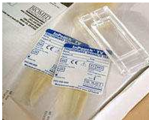
Fig. 2: InPouch culture system: Plastic pouch and microscopic observation chamber