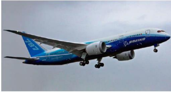
Fig. 2. The Boeing 787 Dreamliner on its first flight

Hong Kong Airlines was interested in purchasing 38 aircraft, including 6 cargo models and 30 Boeing Dreamliner aircraft.