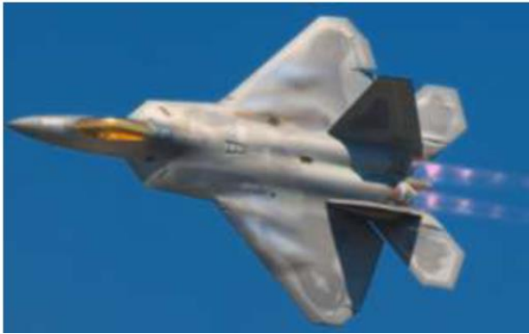
Fig. 1. A pilot peers up from his F-22 Raptor while inflight, showing the top view of the aircraft

Boeing delivered 481 commercial aircraft in 2009, a 28% increase over 2008. The Boeing 737 is still popular with airlines, with 372 deliveries, 88 deliveries for the Boeing 777, 13 deliveries for the Boeing 767 and 8 deliveries for the Boeing 747. Boeing's backlog is now 3,375 including 2,076 Boeing 737 aircraft.