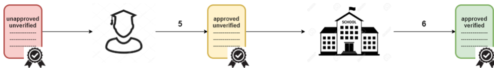
Fig. 2: Confirmation of the smart contract