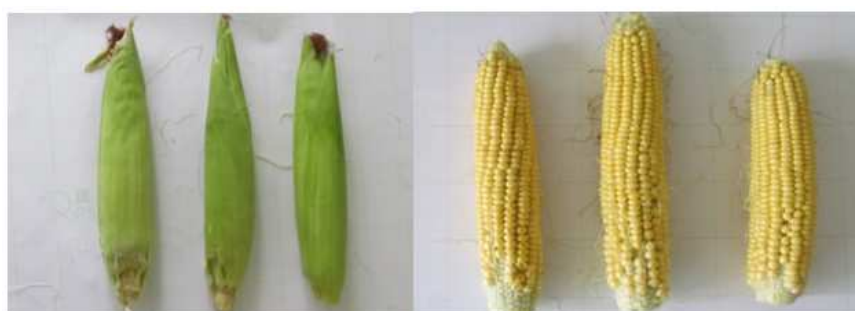
Fig. 7. Cobs of maize for silage