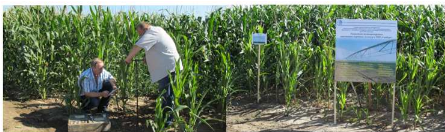
Fig. 4. Observation of soil moisture

In the plots for growing maize, silage biomass of silage maize per plant (cobs up to 1,417 g.) and the number of cobs (1-2) were determined. The weight of cobs ranged from 290 to 400 grams (Fig. 7). The number of grains in maize cobs in the milky-wax phase was counted (500-860 grains). The number of plants per 1 m 2 experimental plot was counted by the fodder crops.