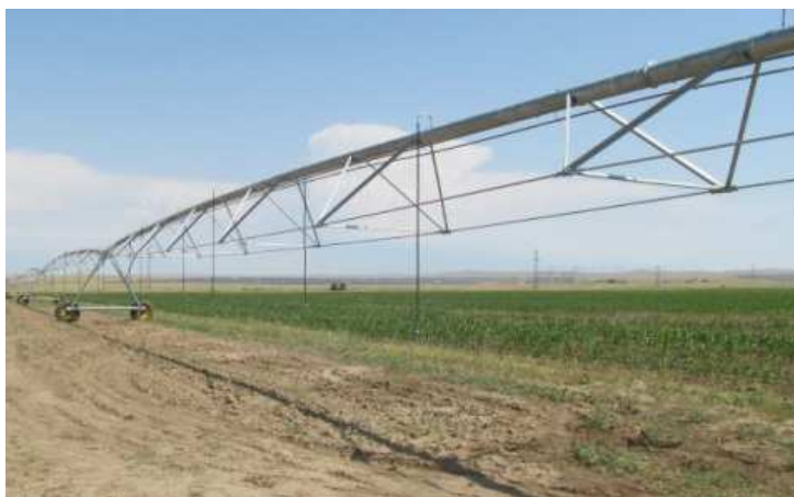
Fig. 2. Irrigation with a T-L circular sprinkling machine