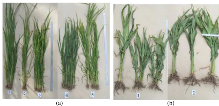
Fig. 6. Taking samples of plants (a) sampling millet for weighing (b) sampling sorghum for weighing