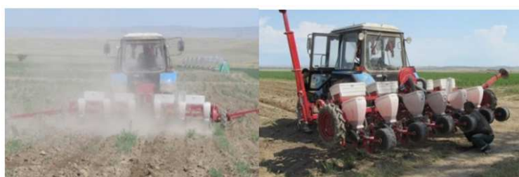
Fig. 3. Sowing seeds of forage and sweet sorghum and millet