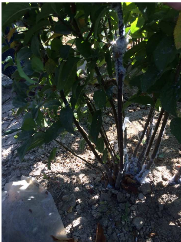
Fig. 1: Damage to seedlings of red woolly aphids ( Eriosoma lanigerum Hausm.) in apple tree nurseries

The larvae of the first and second age pass the winter on the roots of trees, where from 68.7 to 82.4% of the total population are concentrated in Kazakhstan. A somewhat different pattern in the distribution of wintering aphid populations was observed in the forest-steppe of Ukraine. Here, from 53.9 to 62.4% are concentrated on the roots of trees, which is explained by higher air temperatures in Ukraine. It is also significant that from 56.3 to 72.8% of wintering aphid larvae, which are concentrated on the trunks of seedlings on the soil surface, are destroyed by the spring reactivation period. Sudden changes in air temperature and humidity are the main cause of destruction. In addition, the physiologically weakened portion of the aphid population is concentrated here. Spring reactivation of larvae occurs in spring at soil temperature in the crown region of 8-10°C. The process of migration of larvae is long. According to our studies, the duration of the mass migration period was 7-10 days. In tree crowns, their trophic activity is activated at a temperature of 15-17°C. The duration of the larval period of the overwintered generation is 18-27 days. The least long period of development of one generation is observed in late June and mid-August. For Ukraine, this period is 10-12 days, for Kazakhstan - 12-14 days (Iperti, 1974; Hurpin, 1974; Lyon and Goldlin, 1974).