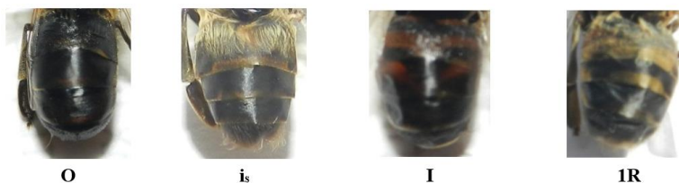
Fig. 4: Morphotypes of drones found in the samara region