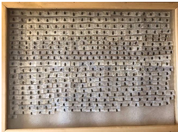
Fig. 1: Samples of collections of honey bees: 1-workers