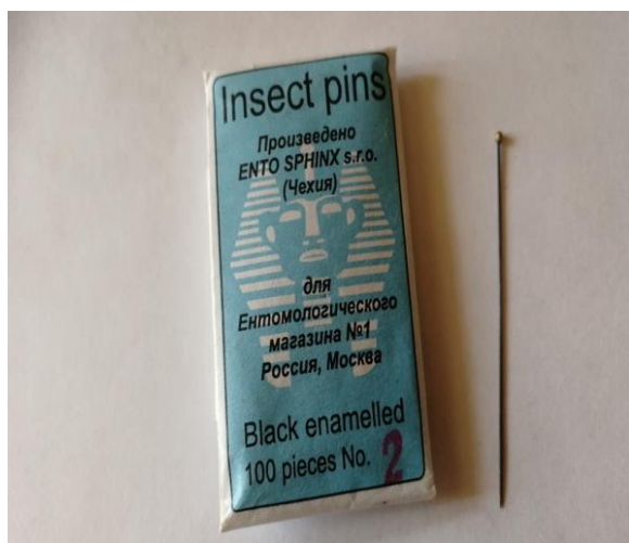
Fig. 2: Sample of entomological pin